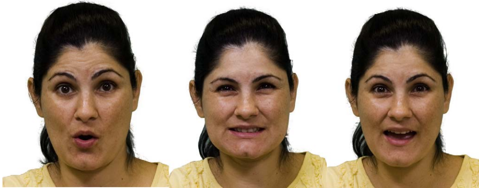
Fig. 2. Compositional intonation in ISL: (a) Raised Brows, (b) Squint, and (c) Raised Brows and Squint together.

and lower eyelids), while emotional expressions involve more actions and both the upper and lower face (Corina et al., 1999; Dachkovsky, 2005). In addition, specific linguistic facial expressions occur predictably with particular types of discourse (yes/no questions, wh-questions, topics, shared information, etc., Dachkovsky and Sandler, 2009), while affective or emotional expressions are idiosyncratic. Finally, as we elaborate below, linguistic facial intonation is closely aligned with prosodic constituents. Affective expressions are not closely aligned with the text, and can even anticipate the linguistic signal and persist after signing stops (Baker-Shenk, 1983; Dachkovsky, 2005, 2008).