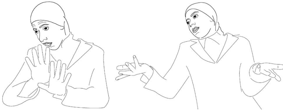
Fig. 4. The juncture of two Intonational Phrases in an ABSL conditional sentence meaning, 'If he says no, then nothing can be done.' Pictured are NO] and [NOTHING-CAN-BE-DONE.